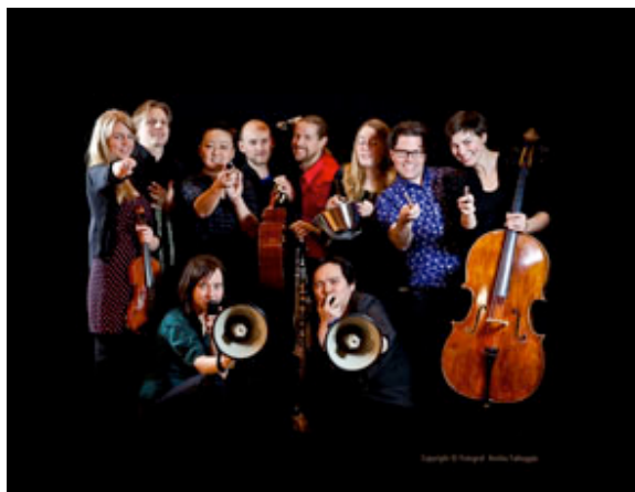
Curious Chamber Players