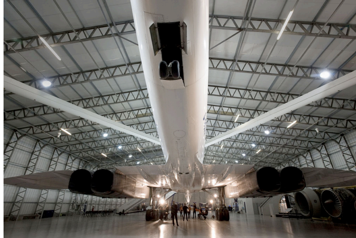
Red Note Ensemble - 1000 Airplanes on the Roof