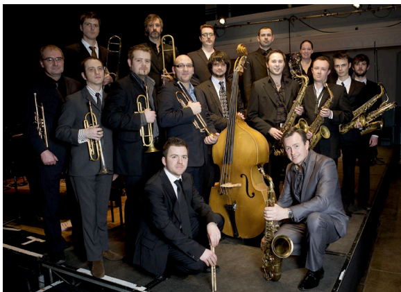
Scottish National Jazz Orchestra