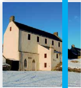
Salmon Bothy, Portsoy