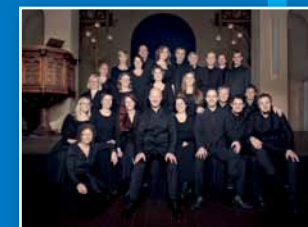
Stavanger Vocalensemble