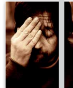
King Creosote