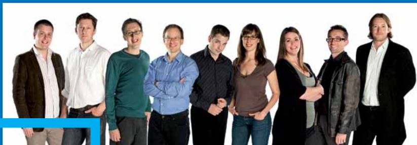
EXAUDI Vocal Ensemble

Madrigali: Fire & Roses , Con Anima's second CD which will be launched in this concert, explores music of love and passion. Italian and English Renaissance works are set against contemporary interpretations of the same texts by composers Morten Lauridsen in his Madrigali: Six 'fire songs' on Italian Renaissance Poems and in Paul Mealor's Now Sleeps the Crimson Petal .