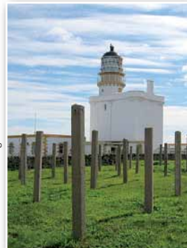
Museum of Scottish Lighthouses

Woodend Barn Banchory AB31 5QA 01330 825431