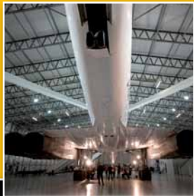
Red Note Ensemble

In this lecture, Jonathan Cross asks some provocative questions about the state of new music today, and even begins to attempt to sketch some answers.