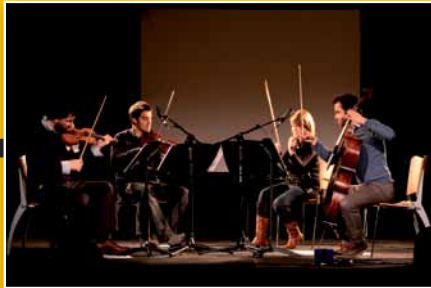
Viridan Quartet