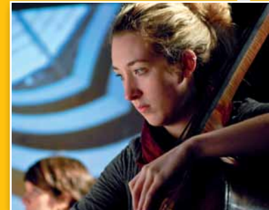
NYOS Futures