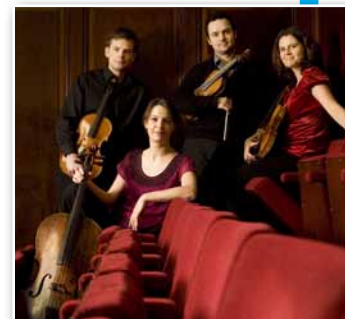
Elias String Quartet

Peter Maxwell Davies Chat Moss Brahms Double Concerto Dvořák New World Symphony