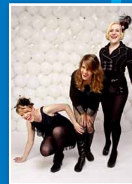
juice vocal ensemble