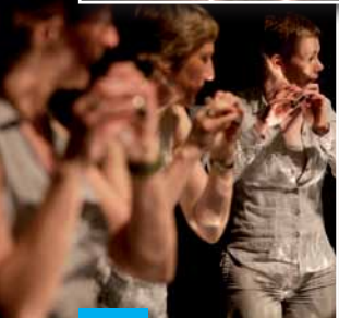
Scottish Flute Trio © Paul Raeburn