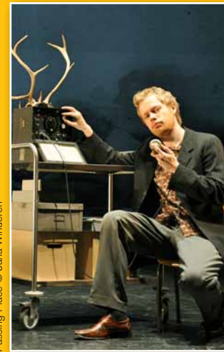
Passing Place