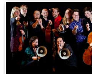
Curious Chamber Players